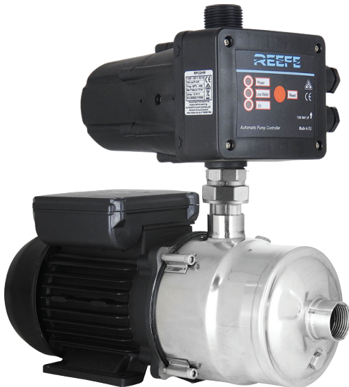
RHMS | PC