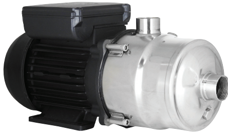
RHMS | PUMP ONLY