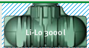
Li-Lo 3000 l

Low installation depth – so no slope angle required