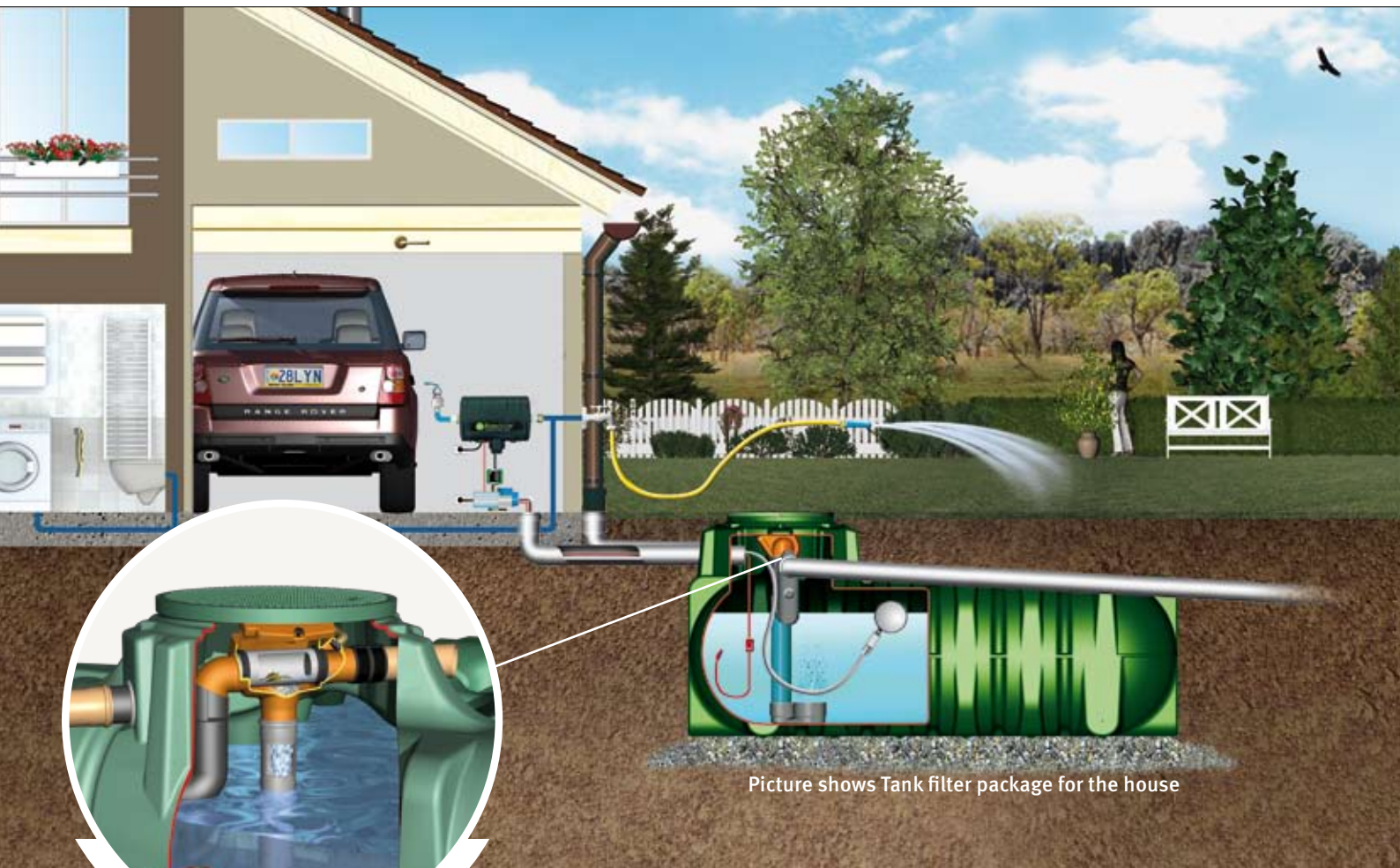
Picture shows Tank filter package for the house