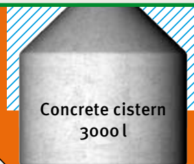
Concrete cistern 3000 l